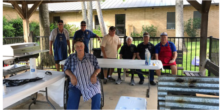
SK's cooking hotdogs and hamburgers for the altar servers and their families at Sts Simon and Jude.